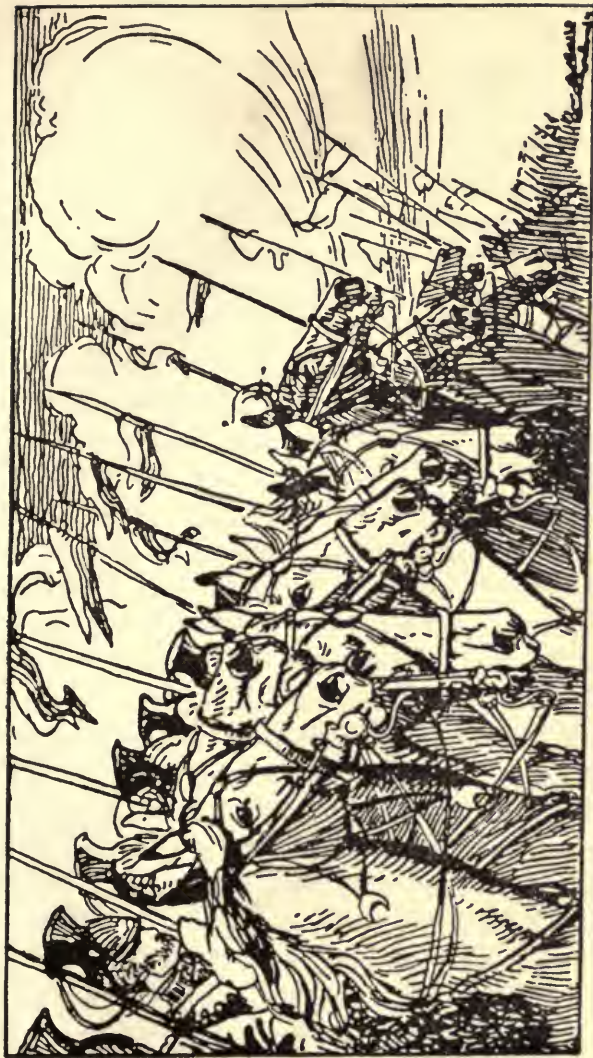
MY DEAR MASTER AND I WERE AT THE HEAD OF THE LINE.